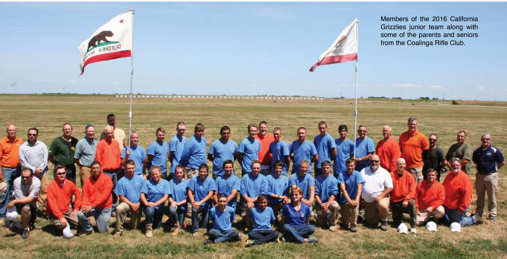
Members of the 2016 California Grizzlies junior team along with some of the parents and seniors from the Coalinga Rifle Club.