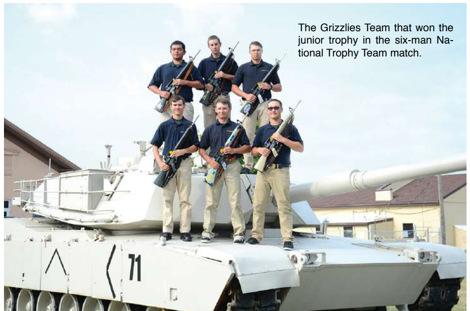
The Grizzlies Team that won the junior trophy in the six-man National Trophy Team match.